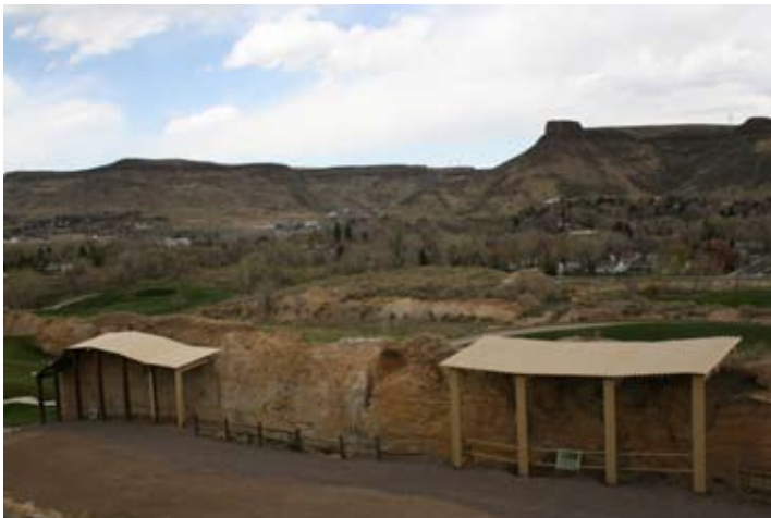
Protective cover at Triceratops trail