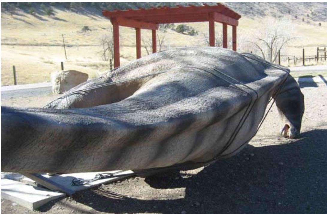
On March 22, 2011, the Iguanodon blew over. A microburst that shot through the Visitor Center area did the damage. We hope to have it repaired and upright soon.