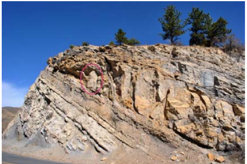
A large rock fell from the south side of the hairpin curve on Dinosaur Ridge Sunday evening, April 10, 2011. As shown in the before and after photos, the rock split as it fell.