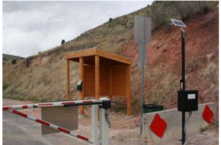
New automatic gate opener

Requests for funding to the Scientific and Cultural Facilities District (SCFD) — We have requested $100,000 for tours and $2,500 for a video about the dinosaur discoveries of Arthur Lakes from SCFD. In preparing these grant proposals, Clare Marshall prepared the charts below that depict the visitation trends from the six counties in SCFD over the last eight years. While the percentages from the counties have not changed dramatically over the last eight years, the total numbers have increased. This is a tribute to the great programs we offer to the schools and the general public, and to the fact that access to Alameda Parkway over Dinosaur Ridge was restricted to pedestrians, bicyclists, and tour buses in July 2008.