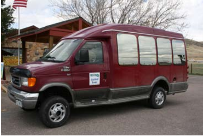
New 24-passenger tour bus

New Tour Bus — The Friends purchased a 14 passenger 2005 Ford bus in April for $16,000 (see photo). It will be used for our tour program throughout the year, especially during the busy summer season.