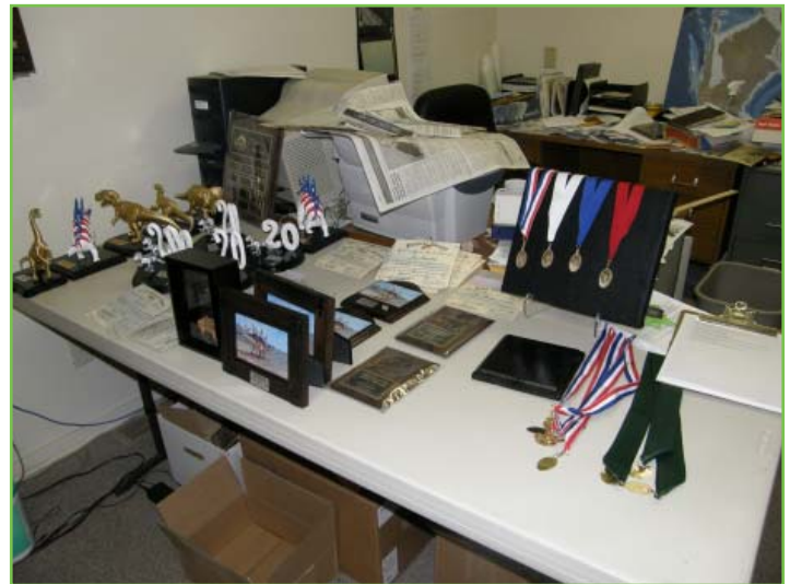
Phew! That's a lot of awards to give out!