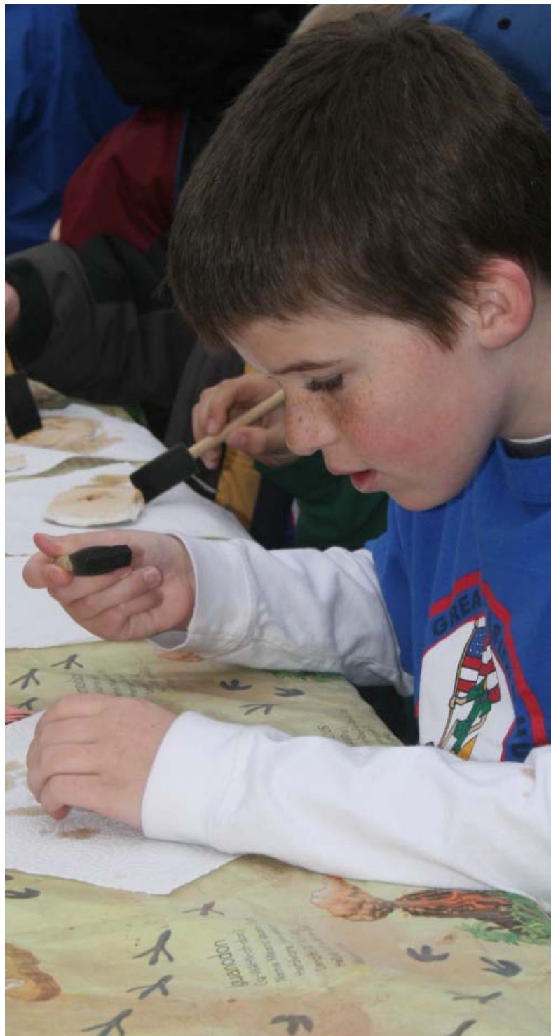
Activities at Boy Scout Day, May 2009 — Details in next issue.