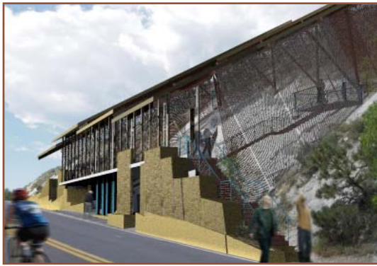
Artists concept of the proposed Track Site Cover

Before we can implement the following new projects on the Ridge over the next few years, we needed to submit a "site plan" to Jefferson County for their approval. We are hoping to get their approval of this site plan in the next couple of months.