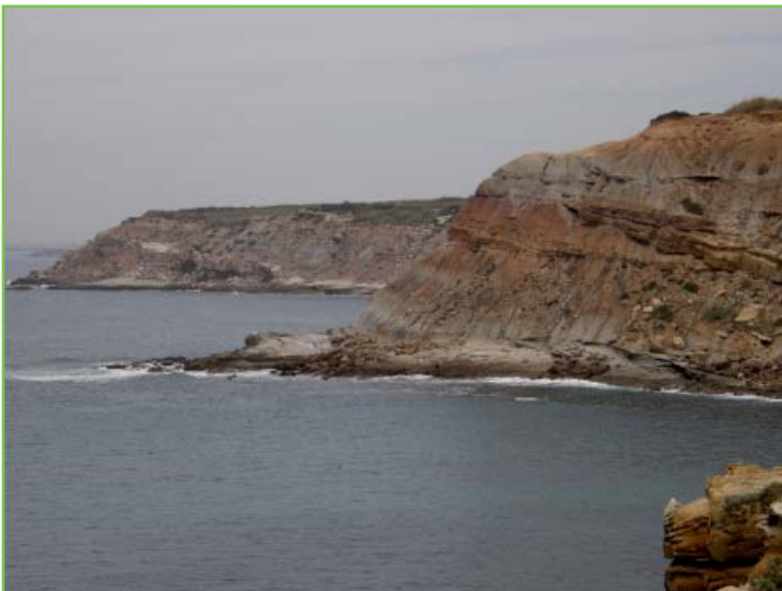
Morrison equivalent beds along the Atlantic in Portugal.