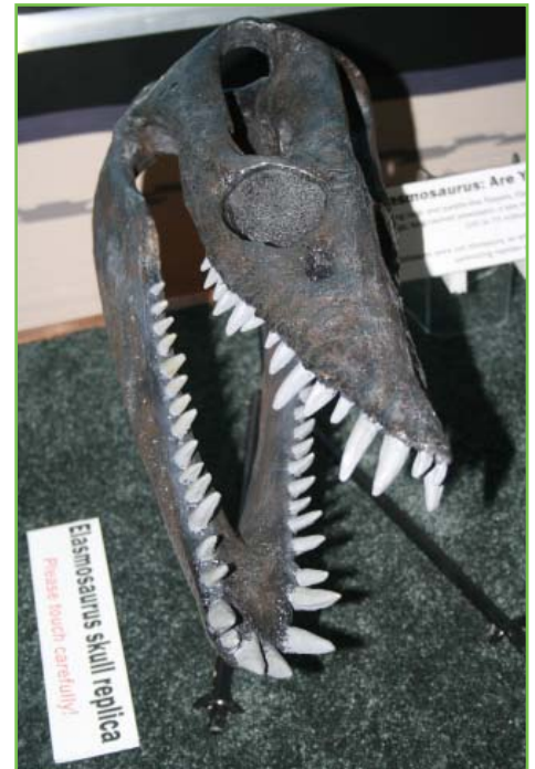
Elasmosaurus skull replica